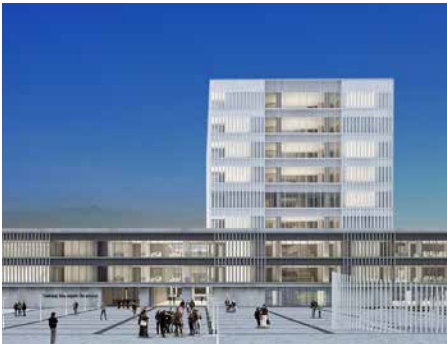
TEKIRDAG METROPOLITAN MUNICIPALITY BUILDING - TEKIRDAG