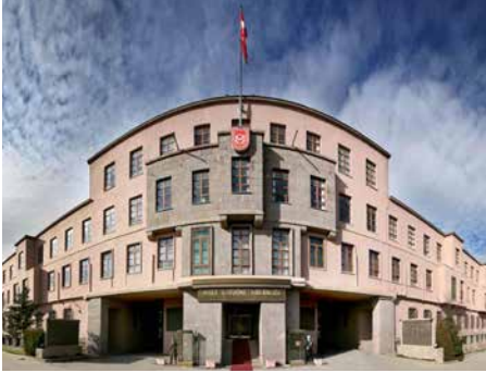
MINISTRY OF NATIONAL DEFENSE COMPUTER CENTER SERVER ROOMS - ANKARA