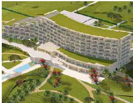
SOFITEL HOTEL & CONGRE CENTER BENIN