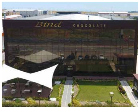
BIND CHOCOLATE FACTORY TEKIRDAG