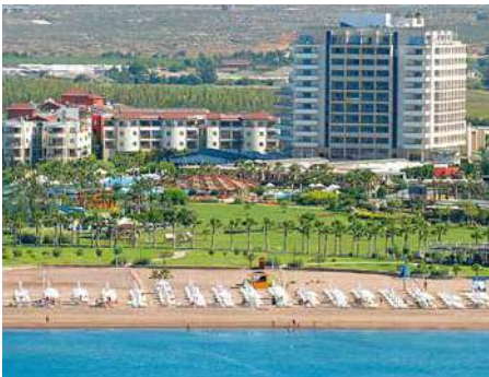
LARA BARUT COLLECTION HOTEL ANTALYA