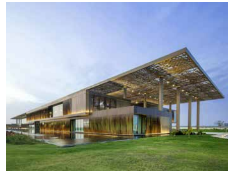
SENEGAL DATA CENTER SENEGAL