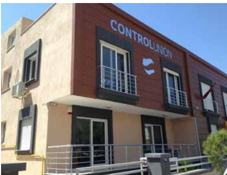
CONTROL UNION TEKSTILE LABOROTORIES ISTANBUL