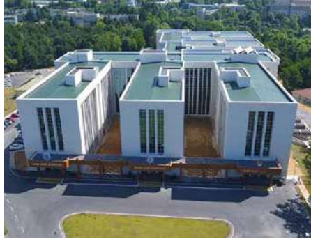
MSU NATIONAL DEFENSE UNIVERSITY INFORMATION CENTER (LIBRARY) - ISTANBUL