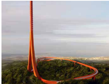
CANAKKALE TERRESTRIAL DIGITAL BROADCAST TOWER - CANAKKALE