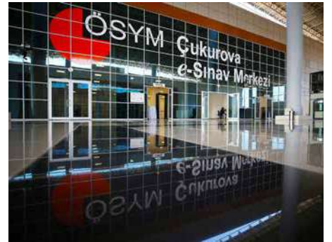
OSYM CENTER ADANA